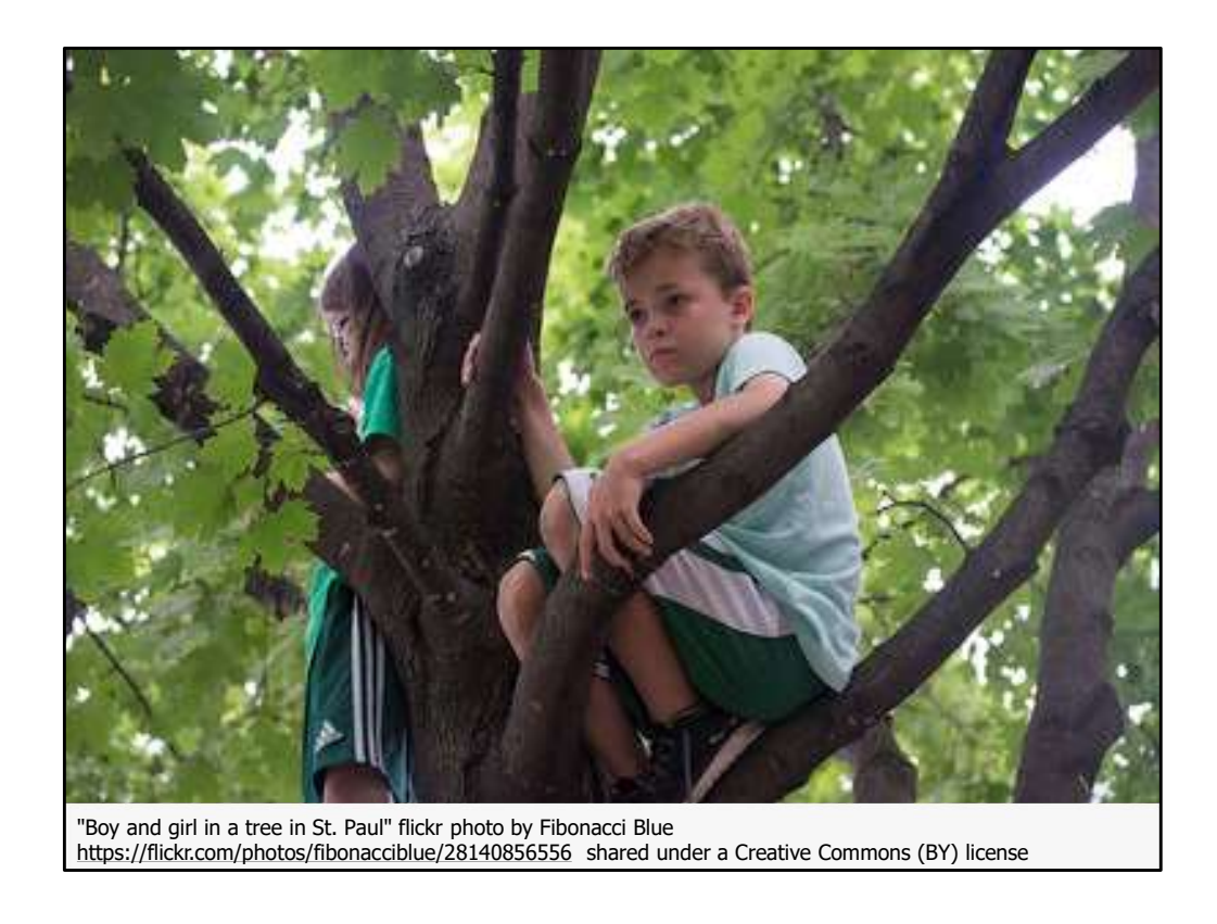
Building familiarisation Use a hook to stimulate interest and prepare the students for part of the story.

Discuss when it is safe to climb a tree (e.g. not at school; with parent's permission; when a trusted adult is watching and guiding)